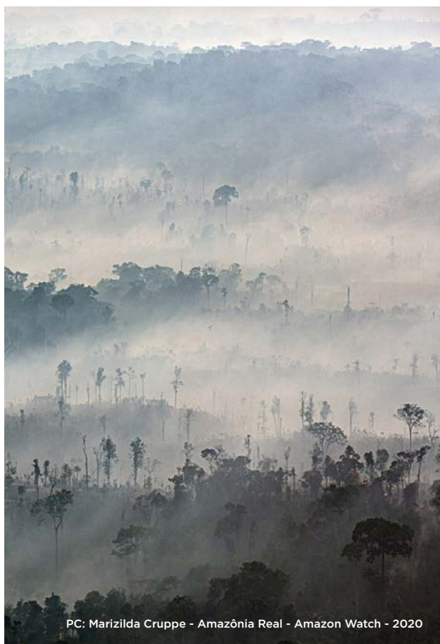
PC: Marizilda Cruppe - Amazônia Real - Amazon Watch - 2020