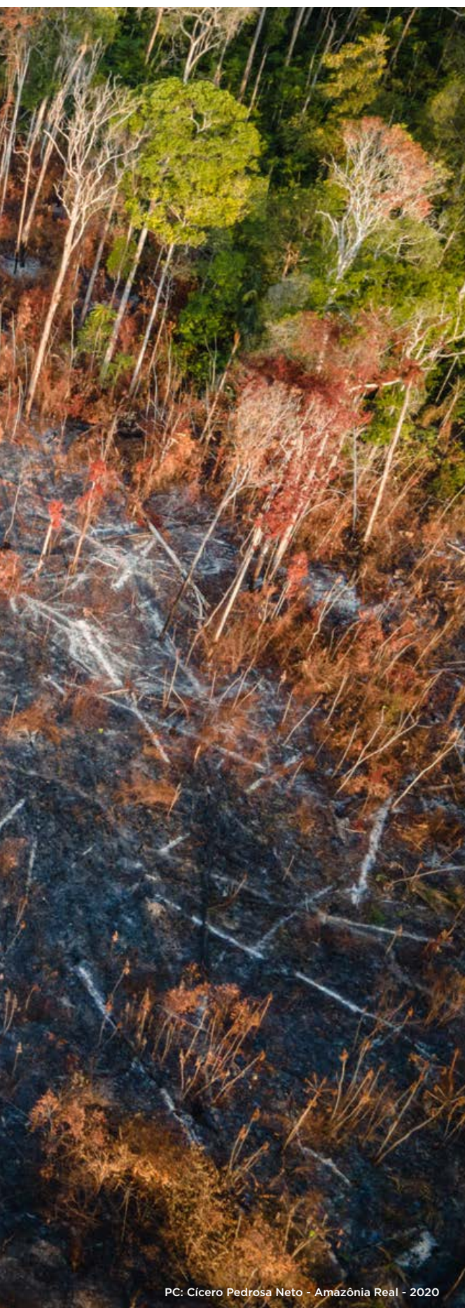
PC: Cícero Pedrosa Neto - Amazônia Real - 2020