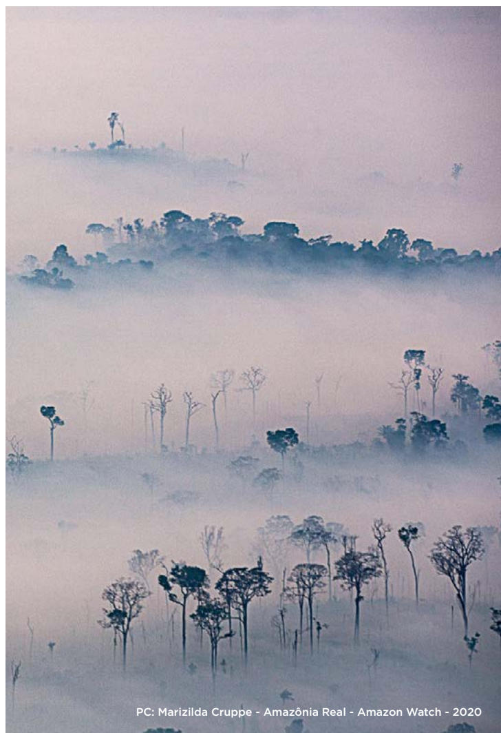
PC: Marizilda Cruppe - Amazônia Real - Amazon Watch - 2020

encourage the spread of wildfires, which may outstrip firefighting capability. (46) Man-made forest fires, such as used for deforestation and land use conversion for crops and livestock, similarly contribute to climate change, destroying important carbon stores and releasing greenhouse gases into the atmosphere.