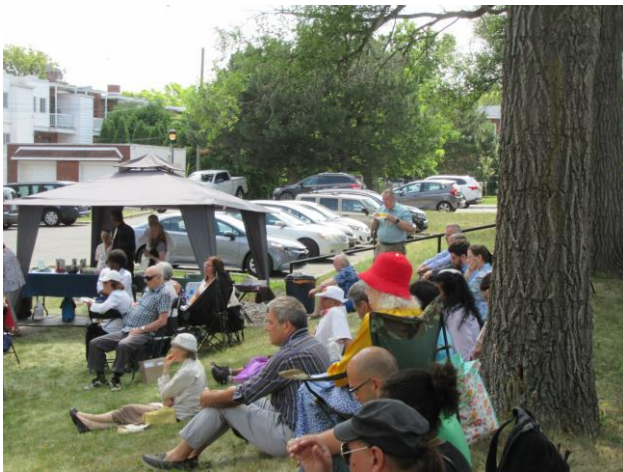
Portion of audience listening to our speakers

“Jesus wishes foremost the spiritual renewal of His priests, for it is above all through their priestly ministry that He wishes to give a new breath, a new impetus to His Church and to build using the powerful rays of grace a new world.”