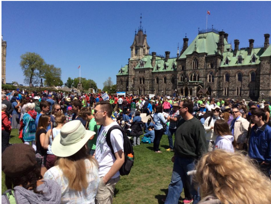
Gathering on Parliament Hill prior to the march through the streets of Ottawa