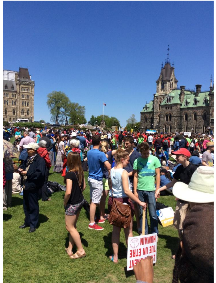
Participants of the National March on Parliament Hill

Further, the day had a very poignant significance as it was 36 years ago to the day that Canada had legally permitted abortion in legislation sponsored by then Liberal Justice Minister, Pierre Elliott Trudeau in an Omnibus bill – the above photo is from Salt and Light Television.