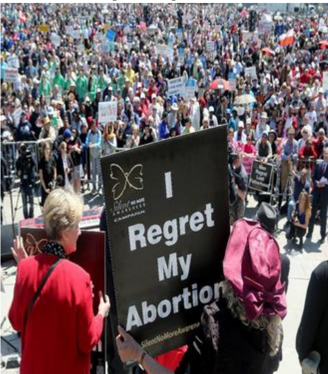
Participants of the Silent No More Awareness group

After the march and having returned to the hill, we listened to both women and men share their experiences of abortion and how it has harmed them. They had travelled from across the country to be in Ottawa and are members of the Silent No More Awareness Campaign fellowship that works at helping men and women grieve and heal from having had an abortion. This is a yearly part of the National March and about fifteen persons spoke.