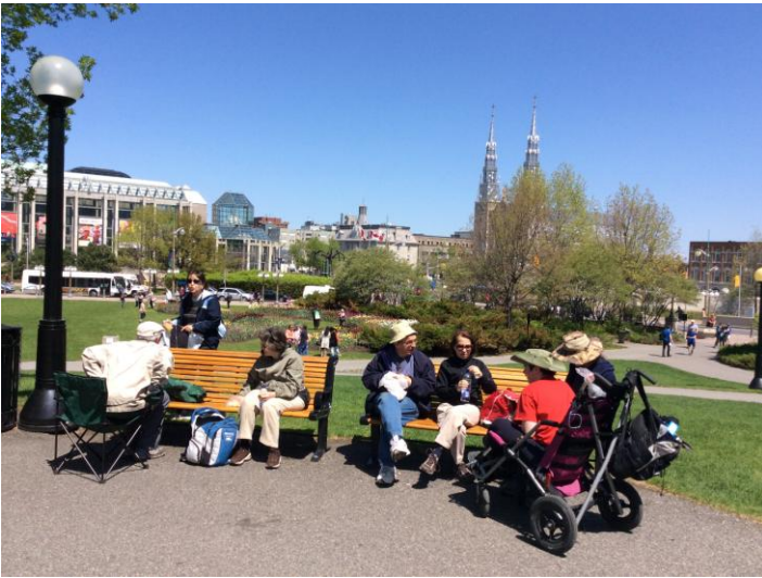
Members of our grouping picnicking in Major's Hill Park

After the march and having returned to the hill, we listened to both women and men share their experiences of abortion and how it has harmed them. They had travelled from across the country to be in Ottawa and are members of the Silent No More Awareness Campaign fellowship that works at helping men and women grieve and heal from having had an abortion. This is a yearly part of the National March and about fifteen persons spoke.