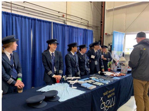
Porter Airlines pilots