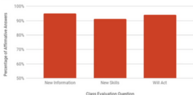
CLEAR Class Evaluation Averages

Between September 2016 and August 2017 there were three CLEAR Miami cohorts, consisting of a total 55 adult graduates and 17 youth graduates. 75.5% of CLEAR graduates are people of color and 87% of CLEAR graduates live in low-income communities. The CLEAR Miami program greatly increased participants' understanding of climate resilience, ways to get involved in their communities, and the intersectionality of climate, environmental and social issues.