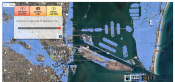
Eyes on the Rise App, FIU

When teaching a topic like climate change to the general public, it is vital to cater to a variety of learning styles. A combination of traditional PowerPoint presentations, guest speakers, facilitated group discussions, small group activities, TED talks, and interactive mapping tools are some methods to keep a diverse cohort of participants engaged.