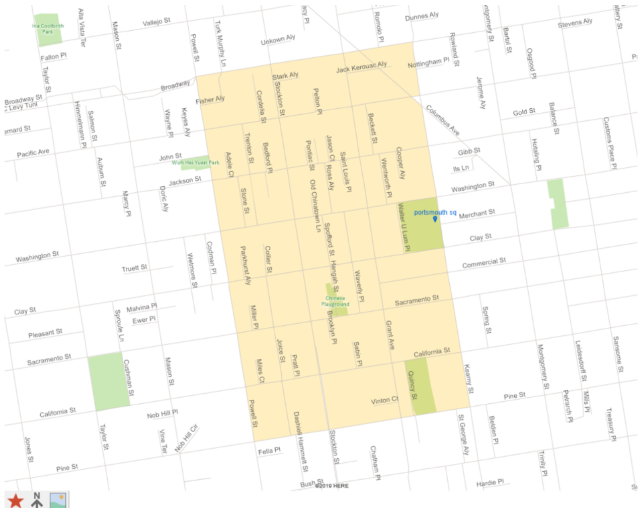
Screenshot of boundaries of SF Chinatown COI

Today, I am urging the commission to respect the integrity of both of these COIs, each holding importance for the Chinese communities we serve in San Francisco. Thank you so much for hearing from me today and the rest of the AAPI & AMEMSA State Redistricting Collaborative.