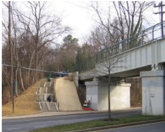
The new access staircase on the north side of Bradley Blvd.