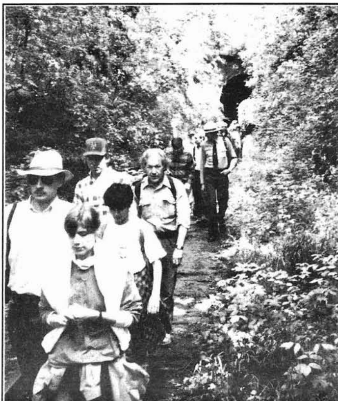
CCCT supporters emerge from the trail's only tunnel during the hike after the May 5 rally.