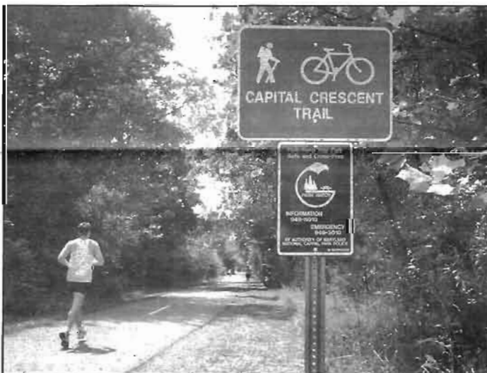
A five-mile section of the Capital Crescent Trail will be closed November 5 between Jones Mill Road and the Dalecarlia Reservoir.

In coming months the CCCT will be calling on the agencies that manage the CCT to develop a consistent shared-use policy for special events