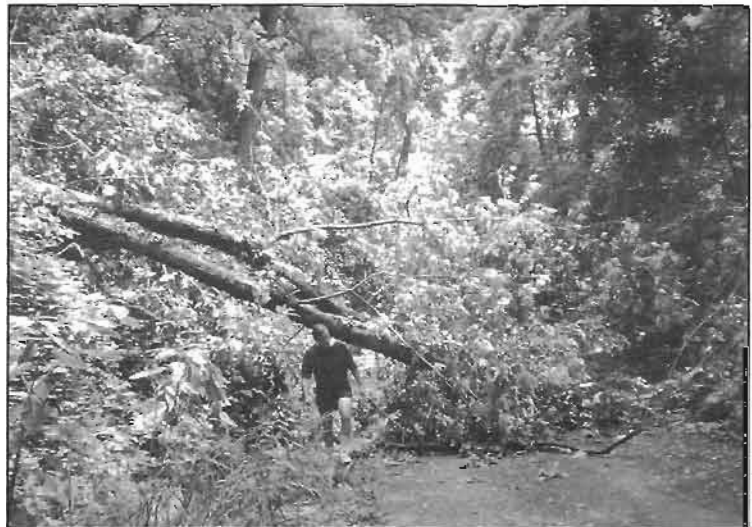
Summer storms took their toll on trees. Heavy rains and winds felled this one, located near Connecticut Avenue, in July.