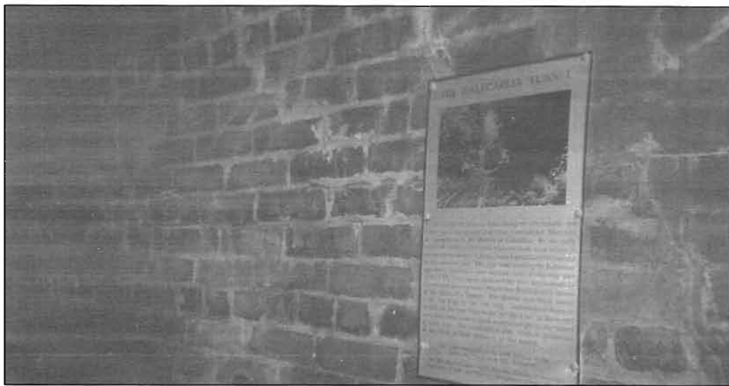
Last summer, Montgomery County Parks coordinated graffiti removal operations at the Dalecarlia Tunnel. The CCCT met with Parks officials to discuss the best way to remove graffiti. Power washing was rejected as being potentially too damaging to the old mortar joints, so crews did their best with wire brushing. Other approaches to removing graffiti are being researched.