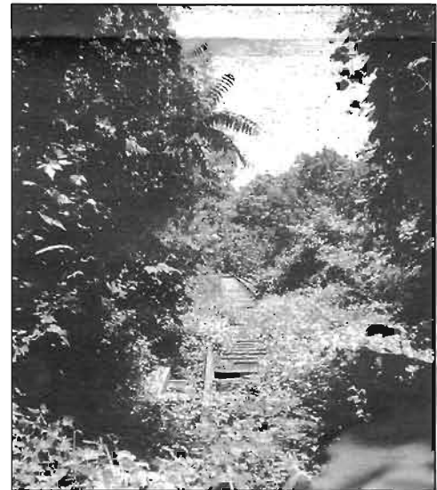
From the treetops, the deck of the Rock Creek Trestle.

DPWT is planning to specify that two 12-foot wide prefabricated bridge sections be used to replace all of the existing wood structure. The DPWT staff do not feel comfortable using the current wood structure, mainly out of concern about kids climbing on it and liability if it should fail. CCCT asked if the DPWT could specify a 14-foot width and a preference for an asphalt or concrete deck, with the 12-foot width and wood deck DPWT is proposing as a fallback only if necessary to come in within budget. In response, the DPWT staff expressed concerns about whether the wider width and asphalt or concrete deck will be possible, given the length of span. As for using a new steel support substructure to reduce span length, DPWT is concerned that any new substructure would trigger a time-consuming permit requirement because of the resulting construction in Rock Creek Park, which is administered by the National Parks Service.