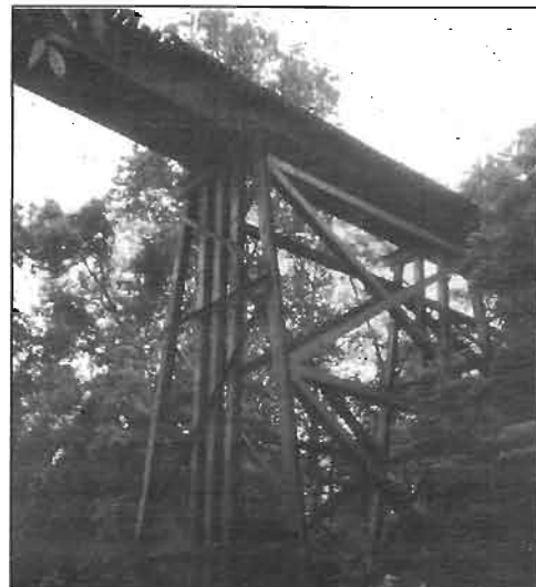
The trestle's wood support beams and columns on its east side (left) and the steel support on its west end (right).

Please designate The Coalition for the Capital Crescent Trail In the United Way/Combined Federal Campaign (CFC) of the National Capital Area. CCCT's CFC number is 7221 Please include us in your CFC contributions or pledges by filing in our designation number on your pledge form.