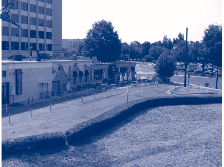
This open space at Woodmont Avenue may soon be lost to proposed development.

The Crescent is published three times a board year (June-June) by the Coalition for the Capital Crescent Trail (CCCT), P.O. Box 30703, Bethesda, MD 20824, phone (202) 234-4874.