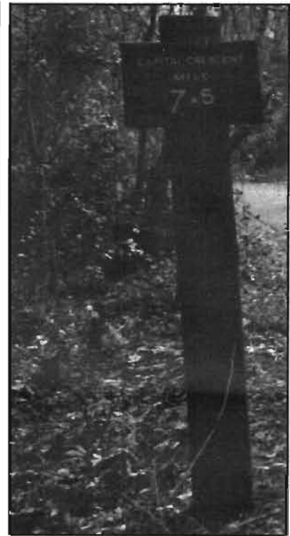
Rail-mileage marker on lower portion of the trail.