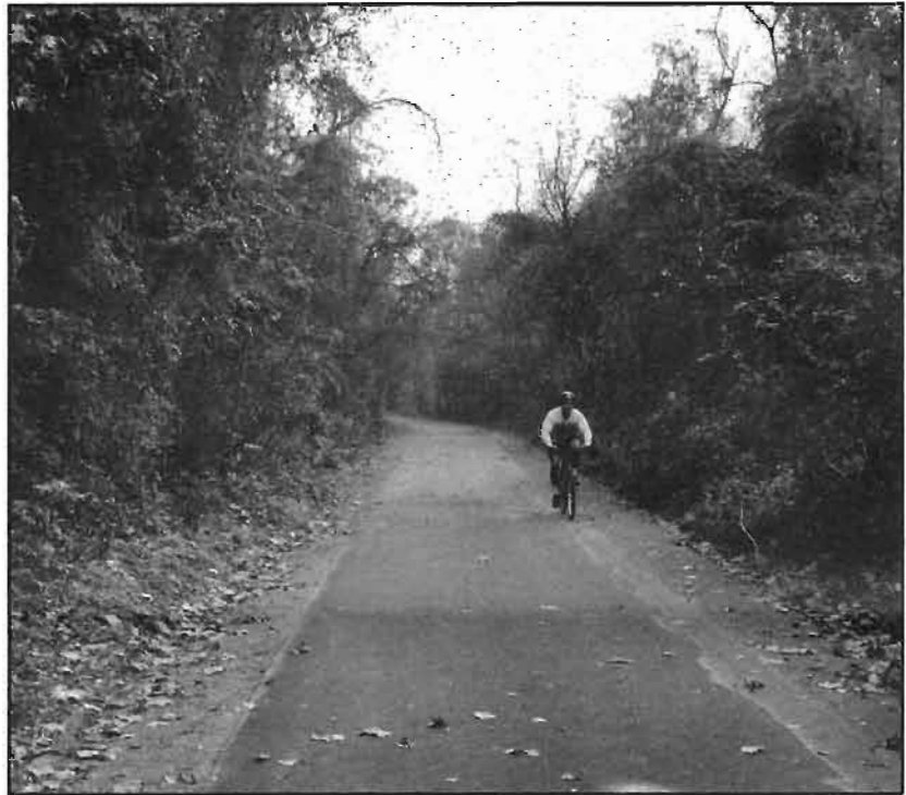
Bicyclist enjoys completed portion of the Capital Crescent Trail.