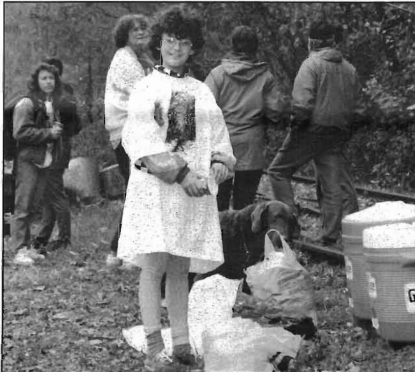
Young supporter models Capital Crescent T-Shirt.