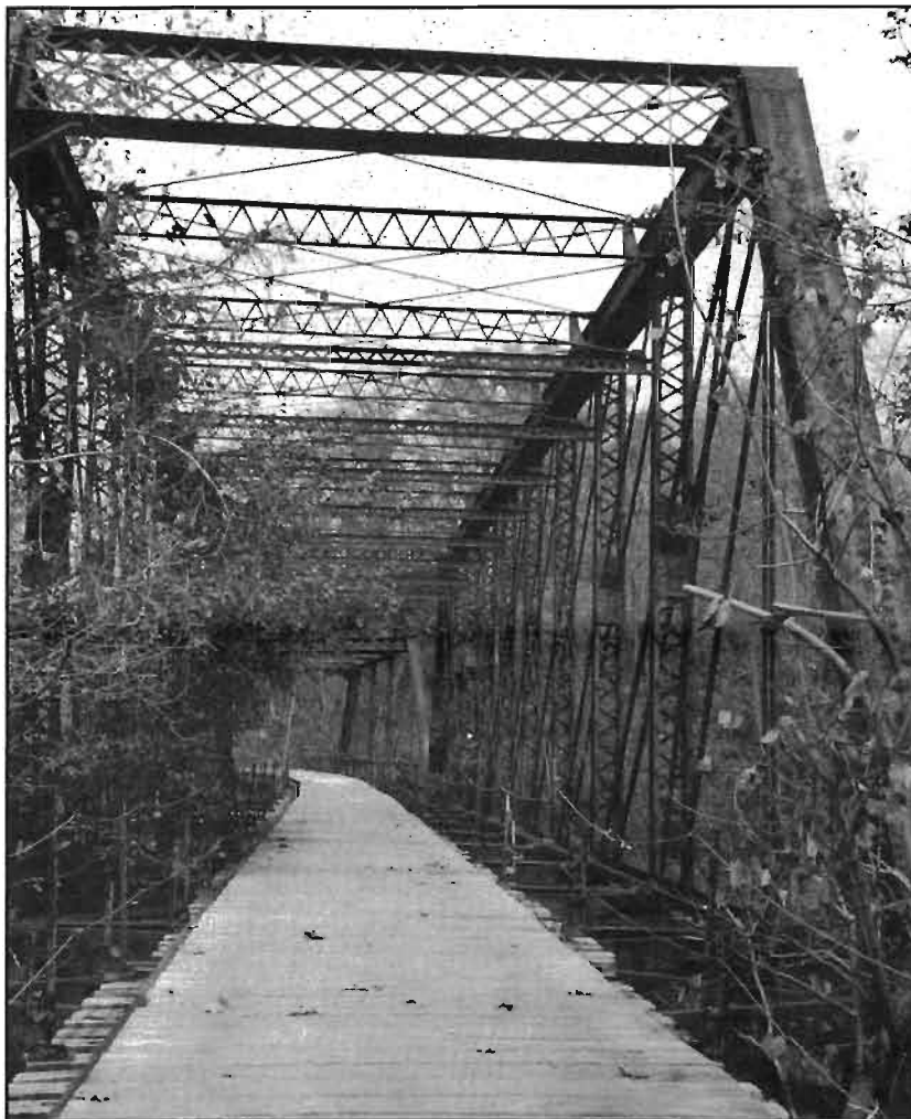
The curved Arizona Ave. trestle posed challenges for engineers trying to fit the Capital Crescent into the palisade shelf in the 1800s. The paved portion will be wider than it appears above when completed this fall.

The Planning Board's recommendation will be submitted