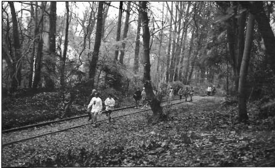
Hikers on Undeveloped Silver Spring Portion of Trail.

T he CCCT board is forging ahead with its continuing efforts to establish an interim trail on the Bethesda to Silver Spring portion of the Georgetown Branch. The CCCT decided at its 1994 Winter retreat to make working with Montgomery County on the issue a top priority. Although substantial progress has been made on the trail, approximately one-third of the right-of-way in the northern portion of the line remains untouched. (See map, page 4)