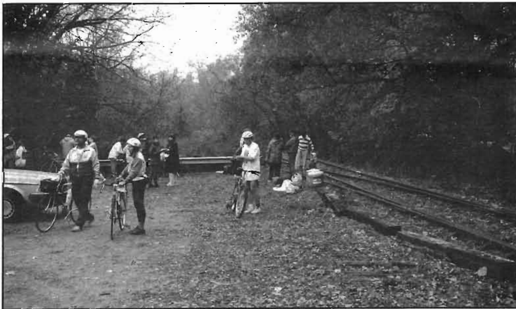
Tour participants hop on their bicycles for the cycling leg of the tour at Connecticut Avenue.