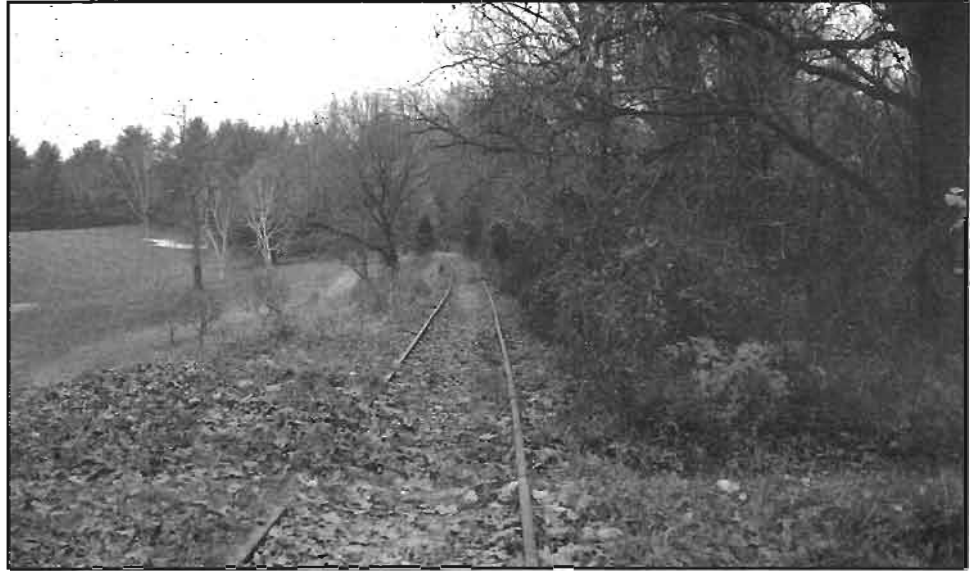
Silver Spring portion of the trail at Columbia Country Club.

In its attempt to minimize the effects of trail corridor developments on the Club and its golfers, the Club had plans drawn up and submitted to the County which called for routing the right-of-way four to five feet below-grade, and constructing three access bridges across the corridor. CCCT representatives prefer to maintain an at-grade trail on the right-of-way, along with the use of "soft engineering" such as trees and other vegetation to shield trail users and course users alike. CCCT presented this option to members of the Club in December. When Club spokesperson Vincent Burke addressed the CCCT board at the February 14 meeting, he indicated the Club was still pursuing the below-grade option. The CCCT is anxious to maintain a dialogue with the Columbia Country Club, and to reach a workable position as it strives toward its goal of an interim trail in 1994.