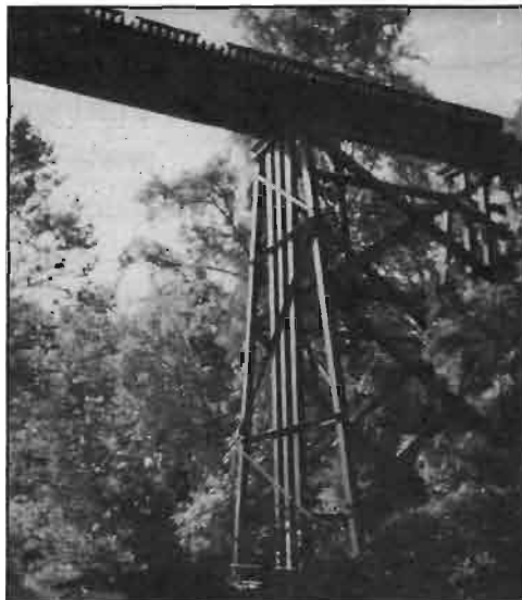
Room for a view -- Center span overlooks will give trail users spectacular views of Rock Creek.

project. The three non-profit organizations gave checks to Montgomery County to fund 2/3 of the additional cost, with DPWT funding the balance. Our contribution was crucial since the observation deck cost far more than the County had available for the project. CCCT gave $75,000, GBCCC gave $55,000, and WABA gave $2500. This is the largest financial donation the CCCT has ever committed to the Trail, far exceeding the previous record-holder of $45,000 committed to improve trail lighting in the Wisconsin Avenue tunnel. Thanks to our generous members, we had a successful end-of-year fund raising effort and are able to make this contribution.