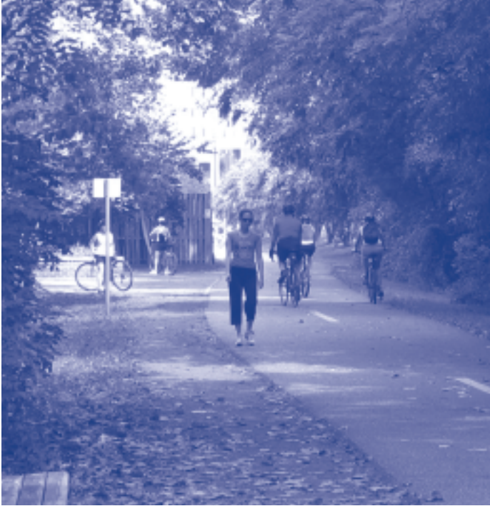
Traffic near the Bethesda Trailhead. This is one of five trail locations where volunteers took detailed traffic data.

The CCCT coordinated a trail traffic survey on the Capital Crescent Trail last fall. A call for help to count trail traffic was enthusiastically answered by 92 volunteers who gave over 140 hours of their time in September to take traffic counts. Volunteers counted trail users over one hour long periods at five locations along the trail, following a protocol developed by the Montgomery County Parks Department. This survey will be used by CCCT for many years to come as we advocate to protect and to improve the Trail.