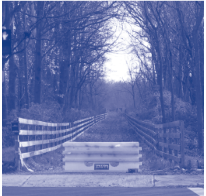
A barrier at Jones Mill Road warns of dangerous trail conditions after the November storm. DPWT has since performed temporary repairs and removed the barrier.

DPWT is now deciding which of the corrective measures it will take. DPWT representative Dan Sheridan has indicated that DPWT can complete at least some of the work early this year with the existing funds. We should finally have an improved and longer lasting trail surface on this section of the trail. CCCT will continue to urge DPWT to continue moving this project forward as quickly as possible.