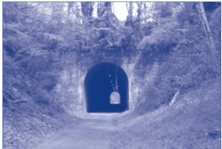
The Dalecarlia Tunnel carries the Trail under MacArthur Blvd. One of the many historical special features of the Trail.

www.cctrail.org for trail updates and events!