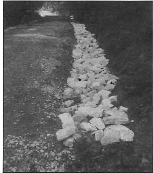
Erosion prevention work along the Georgetown Branch/ Capital Crescent Trail near the 0.5-mile marker.