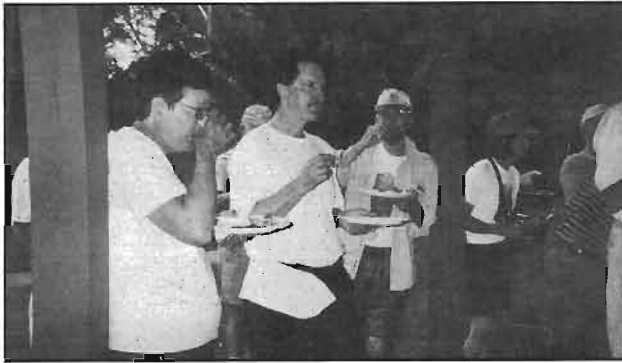
CCCT members chow down during the June 11 th annual meeting held at Elm St. Park in Bethesda.