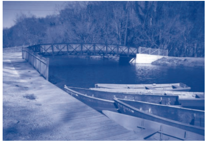
The CCT at Fletcher's Boathouse.

"...the most-used rail-trail in the nation, transporting one million walkers and bicyclists a year to destinations as varied as suburban Bethesda Row, a trendy restaurant hotspot, and Fletcher's Boathouse, an angler's hangout. A green oasis in the midst of traffic-clogged suburbia, the Capital Crescent trail connects suburban Maryland to the Potomac waterfront with many natural and historic destinations in between."