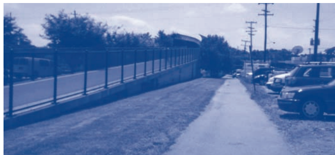
The River Road trail plaza location.