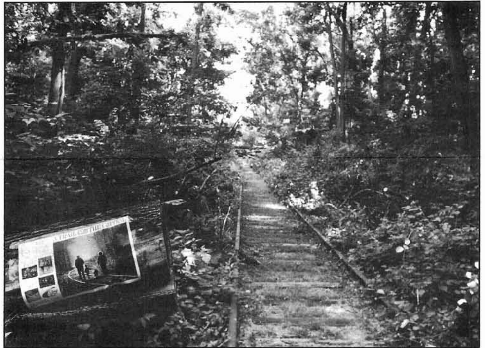
The trail maintenance committee has spent the past few months clearing the trail of debris and overgrowth, while placing CCCT posters at various points along the corridor.