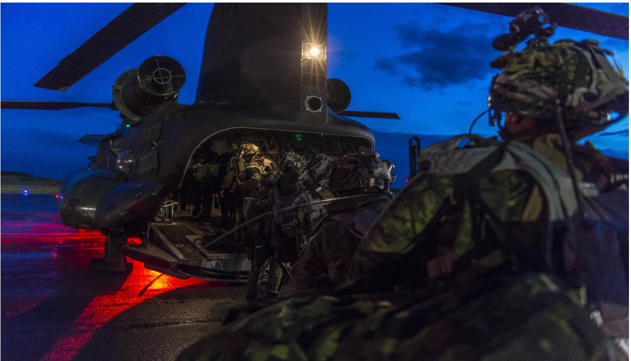
Canadian Forces Image Gallery

Canada's strategic relevance in a world in distress, and its real ability to advance and protect its interests at home and abroad, will continue to rely on the strategic utility of force in the range of crises to come, the reality of relevant options for government, and on the operational and tactical credibility of Canadian forces in all operations, in particular on the land amongst the people, up to and including combat. We do not live in a fireproof house nor are we immune to the real need to promote peace and fight for security, where needed, internationally. A team of integrated Regular and Reserve forces that are general-purpose and combat capable, within a brigade-based Army that is founded on a modern, adaptive and innovative institutional system of doctrine, training and force generation, will remain core to the CAF's capacity to generate and sustain options for the government, and to the credible, confident and capable application of land forces — with partners — in operations. And, in communities across the country, the Canadian Army's contribution to the real presence of the Canadian Armed Forces at large will be key to remaining connected with citizens.