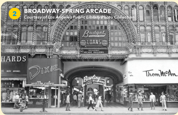
2 BROADWAY-SPRING ARCADE

A 70-acre cemetery founded in 1877, Evergreen was the first privately owned burial ground to serve the city. In 2003, the Latino Urban Forum and neighborhood residents rallied support to create a soft jogging path around the cemetery.