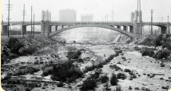
8 NEWLY CONSTRUCTED 4TH ST VIADUCT, 1931