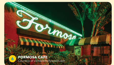
6 FORMOSA CAFE