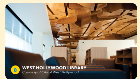
8 WEST HOLLYWOOD LIBRARY