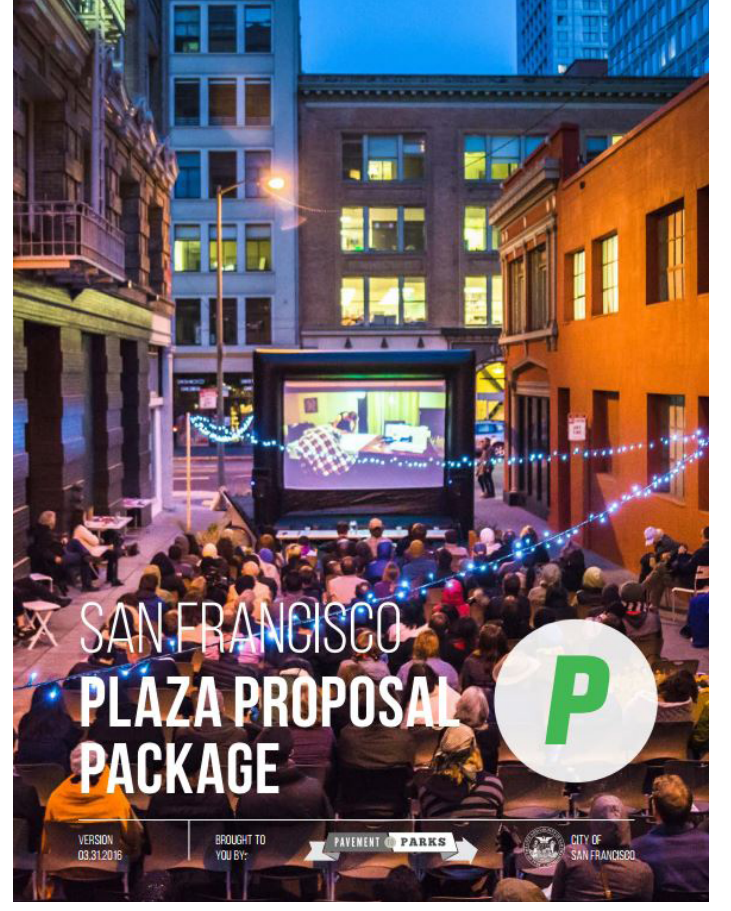
San Francisco's Pavement to Park's Plaza Application

The projects are to be on a two to three month schedule. The artist will receive support from Great Streets, DCA, and the Arts Commission although the artists must still obtain and pay for the required permits.