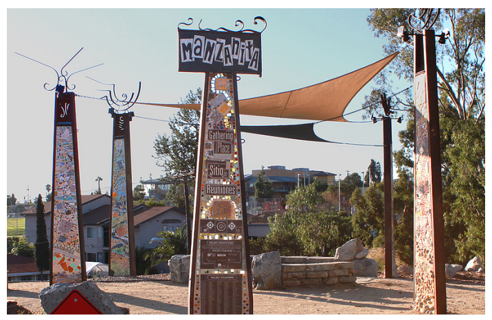
Manzanita Gathering Place, After

A $5,000 grant from the San Diego Foundation allowed the community to come together in 2013 to create change, and an additional $50,000 was eventually obtained to complete the project.<sup>6</sup> According to residents involved, the project showed the neighborhood that big change can happen with a small budget, and empowered residents to be part of the change. It also convened community members to collectively develop art that reflects local culture and creates neighborhood identity.