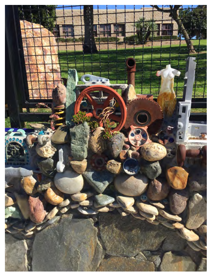
Placemaking, National City

and engaged. National City is addressing the entire spectrum of creative placemaking with its approach by first engaging and educating the community, building temporary projects, establishing a creative placemaking process for permanent pilot projects, and also developing a process for community-led City approved projects.