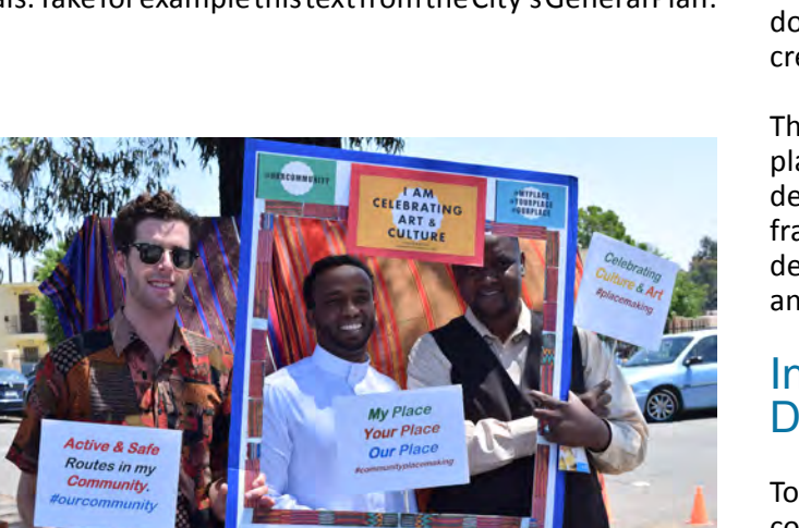
Somali cultural celebration.

As the City of San Diego strives to implement the City of Villages strategy in its General Plan, and Vision Zero strategies in a manner that aligns with the new Climate Action Plan (CAP), City leaders must find opportunities to deeply engage diverse communities about their vision and priorities for the future. Creative placemaking offers San Diego a process that utilizes a collaborative approach to tap into the needs of the community with the talents of its thriving arts community while achieving multiple City-wide goals. Take for example this text from the City's General Plan: