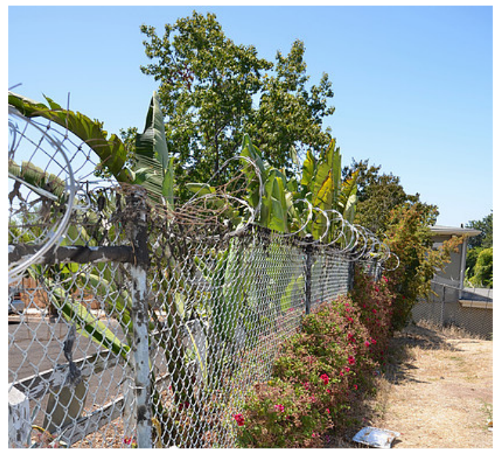
Manzanita Gathering Space, Before

Manzanita Gathering Place sits on a 1,500 square foot lot, within one quarter mile of four schools and surrounded by residential and mixed-use development in the urban community of City Heights. Owned by the City of San Diego, the undeveloped lot served as a dumping ground for old electronics, furniture, shopping carts, fences, and needles. Neighbors, business owners, schools, community artists, non-profits, contractors, and representatives from the City of San Diego worked together to transform a dead end space in a local canyon into a safe gathering place, while also improving the overall ecological health of the area. Using a participatory design process, engagement included an intensive week of community input and design workshops followed by community art making days, and a four-day community build event.