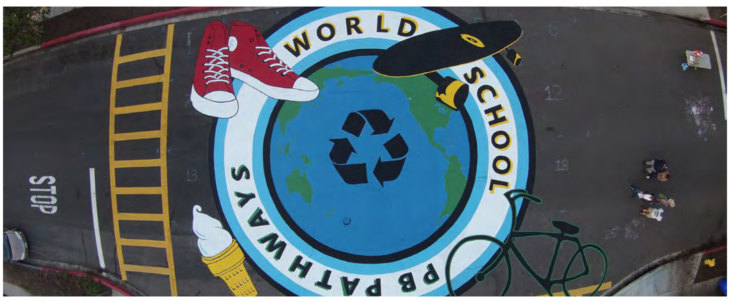
Pacific Beach Mural.

SanDiego prides itself on its diverse, unique neighborhoods. Residents are willing to step up to implement their own vision of their space, especially in areas that are highly underutilized. One step the City can take to achieve its own goals, is to explore creative placemaking and not only allow, but also encourage communities to work together to create the places they want to see. This requires the establishment of a new creative placemaking permit process in partnership with multiple City departments, including Development Services, Neighborhood Planning, and the Commission for Arts and Culture.