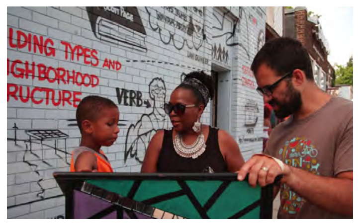
Creative CityMaking Minneapolis

The results of this were powerful. The artists engaged more than 1,800 people, and completed 58 events and dialogues about planning issues. Artists came up with 22 new tools to engage communities. They discovered that planners were most successful in engaging communities of color. This inspired more than $1,000,000 in grant funding as well as a different culture of integrating creative placemaking into ongoing planning processes. The initial success sparked more grant funding in 2015 for Creative CityMaking to expand into a total of five city departments. As of 2016, the City had started funding positions to sustain an embedded artist because of the value they provide.