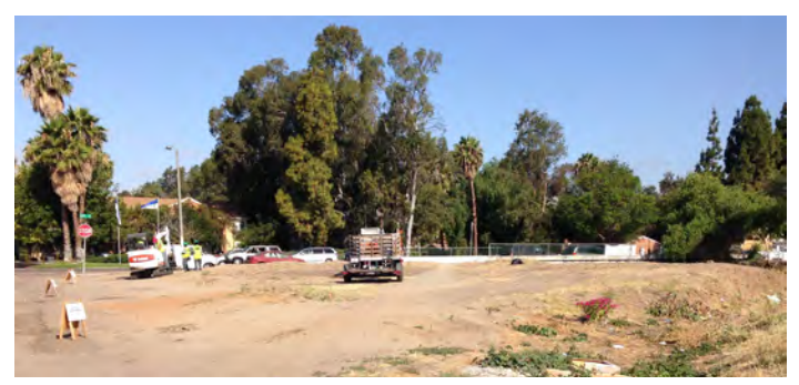
Cholla Creek Crossing Space, Before

volunteers helped design and build their dream gathering space in 2014. Groundwork San Diego raised $50,000 in funds initially and then another $35,000 to fund the effort. The revitalized lot served as a gathering space for the community and helped to build relationships according to the director of Groundwork San Diego.