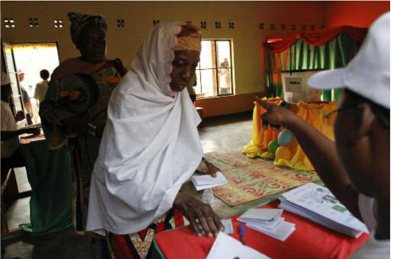
A woman casts her vote at a polling station in Kigali, 9 August 2010.