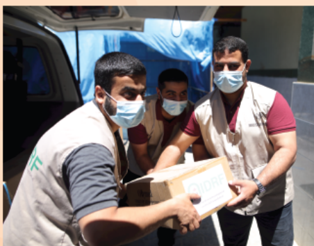
Above: Gaza aid workers unload medical supplies provided through CJPME's "Gaza Emergency Aid" initiative in May.

a medical-grade oxygen generating unit to Gaza's Al-Shifa Hospital. Since the onslaught of COVID and increased hospitalizations, Gaza health care facilities had suffered from a chronic shortage of medical oxygen.