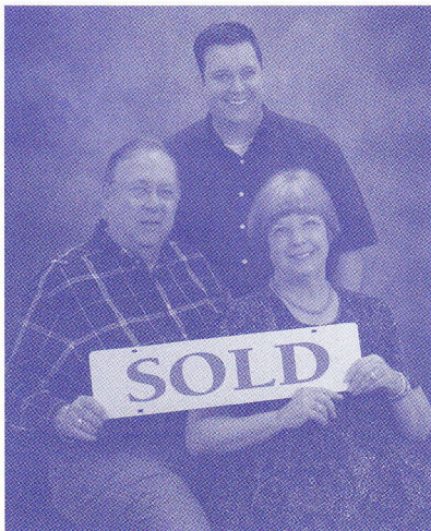
Clear Lake City residents since 1973