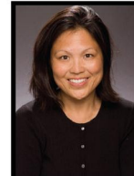
Julie Su Labor Commissioner of California

Don't wait-- In previous years, we have sold out!