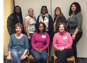
Class of 2016

Register now for the 2017 Civic Engagement Institute and learn how to be an effective volunteer for the causes you care about. The session begins February 11th and meets for four Saturdays. 9:30-12:30. Click here for more information and to sign up.