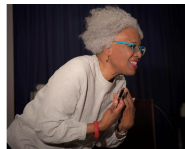
Dr. Nell Irvin Painter