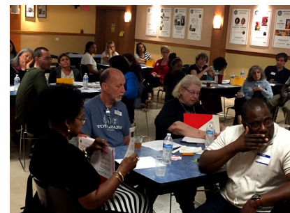
Coffee House Discussion: Race & Privilege: Going Deeper.