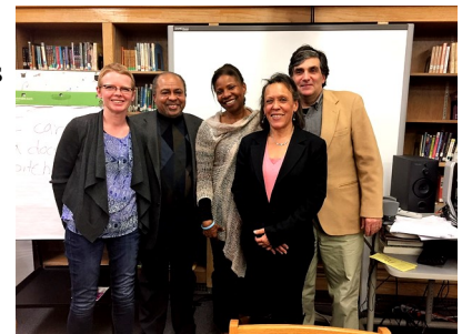
2017 Talking to Children about Race panel