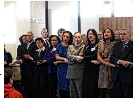
Community & State leaders join together to sing 'We Shall Overcome' at the 2016 MLK Observance.

We invite you to have a look at our 2016 highlights and find your place with us in the coming year.