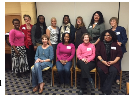
2016 Civic Engagement Institute trainers and graduates