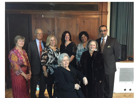
2016 'Celebrating Integration' Honorees