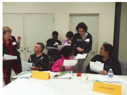
New Program! The Civic Engagement Institute

Throughout 2013 we heard from a range of groups and individuals beyond our borders seeking information on diverse communities and programs that support racial integration. We talked to a doctoral student at Vanderbilt University who wanted to study towns that faced demographic change and worked intentionally to foster integration. She told us that we really are a prime, enduring example of successful integration, and her study focused almost exclusively on our community. We also spoke with researchers at the Oak Park Regional Housing Center in Illinois, whose goal is to expand housing options for people of all races. To better serve their region, they are creating a toolkit of pro-integrative strategies. Once again we heard that we are one of the only communities in the country today with a dedicated organization to work on integration.