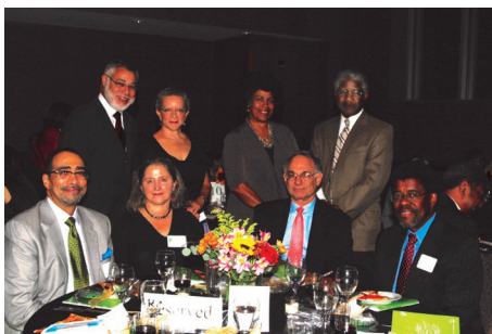
2013 Celebrating Integration Awards Dinner

We are excited to share our work with other groups. At Building One America's National Summit we heard that many communities are struggling with racial and ethnic isolation. Our main message to them is that there is power in this grassroots work. We are most effective when we get neighbors to talk to one another; get parents to discuss their concerns about raising their kids in a diverse community; bring leaders together to deepen their understanding of issues like the achievement gap or how to increase racial inclusion in civic roles; market the towns to people of all races and backgrounds; get families to think about race, about building cross-race friendships, about sharing a life together in a community that cares for and respects people whatever their background.