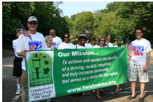
Memorial Day Parade

While the study warns that the usual trajectory for diverse suburbs is racial instability and resegregation, the authors hold out hope that this pattern is not inevitable. "Stable integration is possible but, it does not happen by accident. It is the product of clear race-conscious strategies, hard work, and political collaboration among local governments." This is precisely the work of the Coalition.