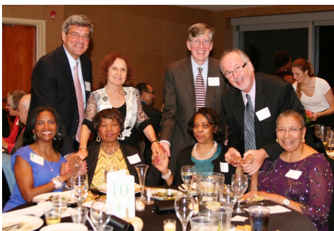
Guests at Celebrating Integration join hands!

Yet these suburbs have a tough time remaining integrated. According to Orfield and Luce, census data since 1980 show that integrated areas are highly vulnerable to resegregation over time. The Community Coalition on Race has ensured that South Orange and Maplewood buck that trend through its work on stable racial integration.