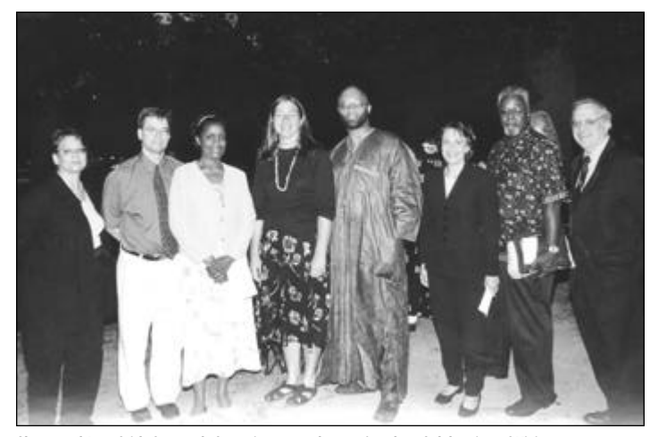
Clergy and Interfaith Outreach Committee members enjoy the "Celebration of Vision."