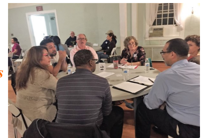
Coffee House Discussion with the Latinx community