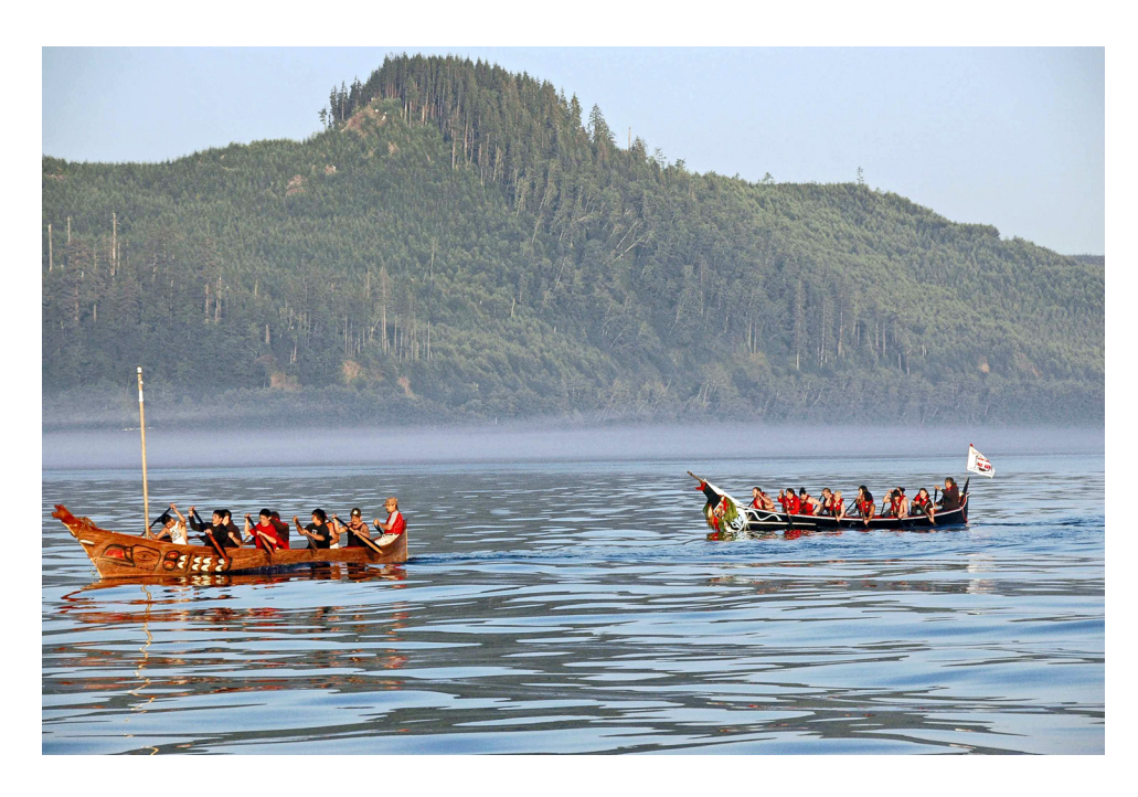
"Annual Canoe Journey, Washington"

Any space, three-dimensional or digital, presents an opportunity to surface buried truths and lift up Native sovereignty, priming our collective culture for deeper truth and reconciliation efforts.