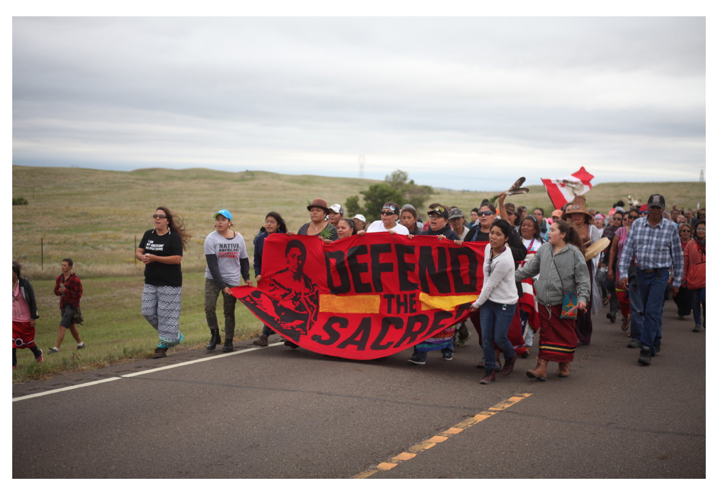
Marchers at Standing Rock 2016