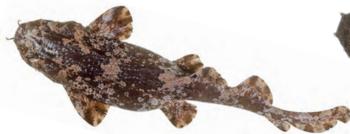
Illustration © R. Swainston www.anima.net.au

Length to 31 cm. Greyish brown with dark patches around eyes, on back, on middle of pectoral fins and above bases of pelvic fins.