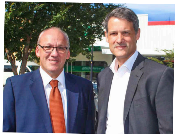
Luke Foley MP with Bryce Wilson.

Snowy Hydro Limited is currently co-owned by NSW (58%), Victoria (29%) and the Commonwealth (13%). In the recent budget, the Commonwealth government proposed acquiring complete ownership in order to progress its plan to invest in additional electricity generation.