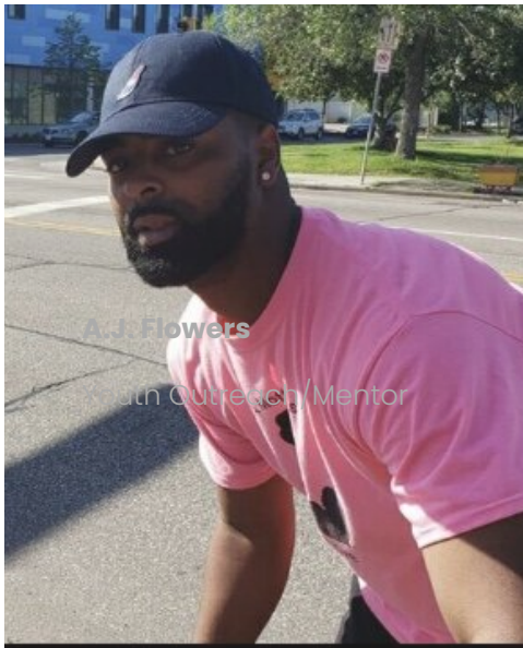
A.J. Flowers Youth Outreach/Mentor