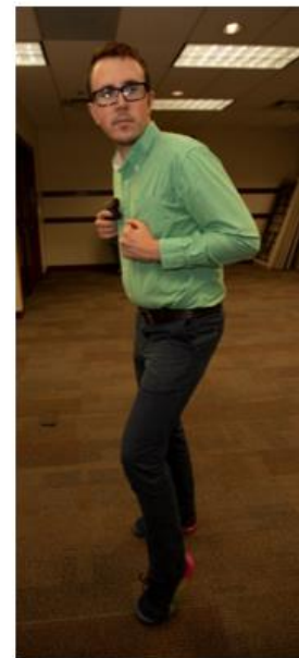
Photo session with a model of the same height and weight as Thurman. The photographs are from multiple angles around the model. The model was posed with a replica gun of the same size and type that Mr. Blevins had. However, Mr. Blevins was not actually holding a gun. The photos indicate that with the position of his right elbow, it would have been impossible for his arm to reach far enough across his body for a gun to be visible on his left side.