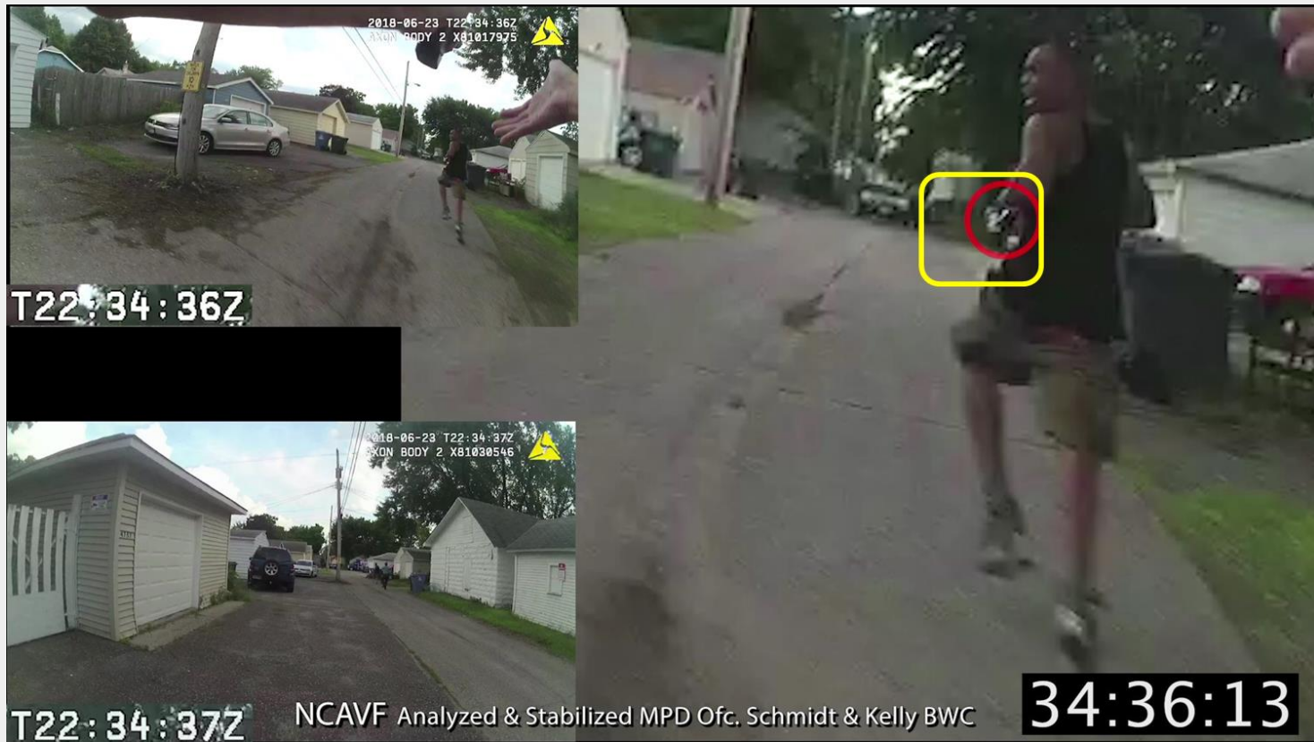
Frame 3: Inside the red circle, NCAVF added pixels to make the merged truck pixels appear more like a gun.