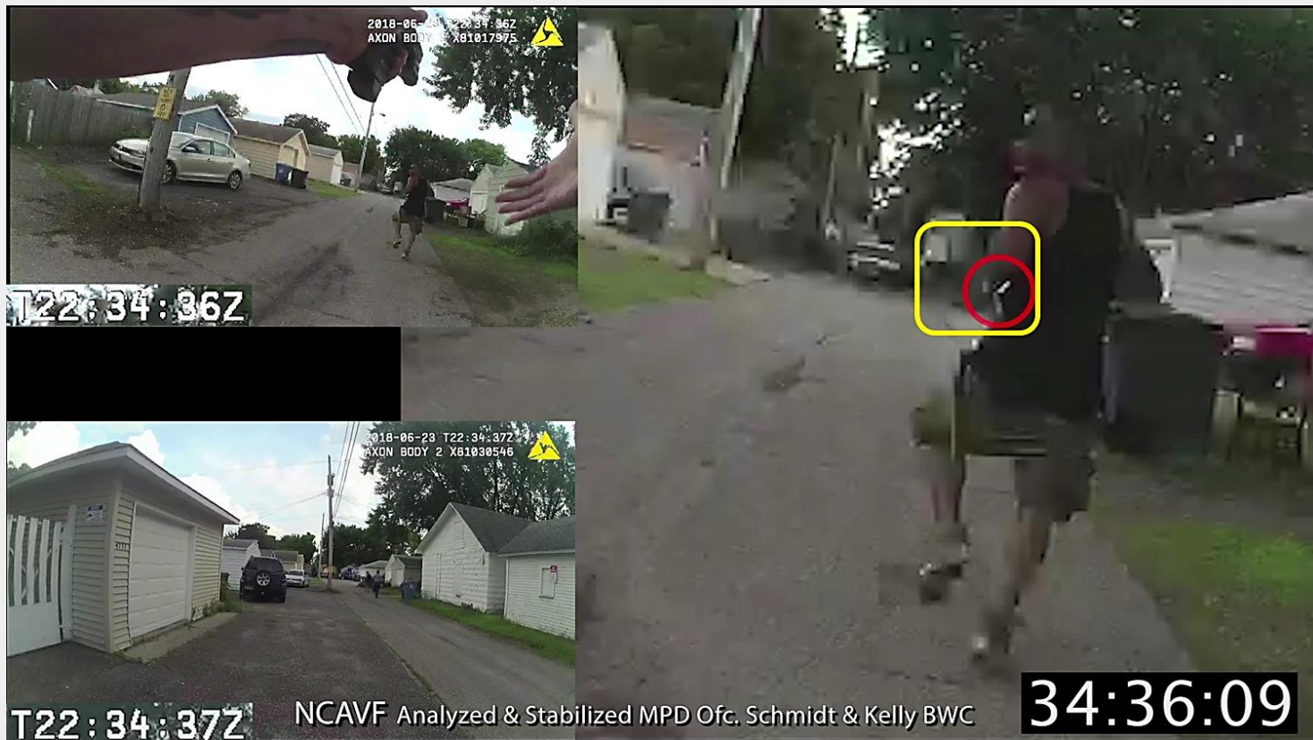
Frame 2: As Mr. Blevins approaches the truck, photo captures the pixels merging inside the yellow box. NCAVF circled the pixels, claiming falsely this is a gun.