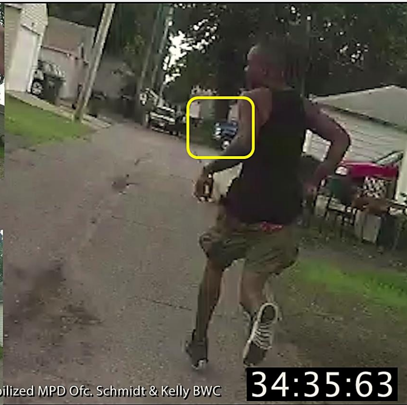
Frame 1: Bumper, hubcap and headlight frame of plumbing truck clearly seen in yellow square.