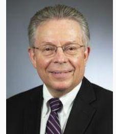
Rep. Elkins District 49B