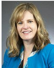
Rep. Moller District 42A