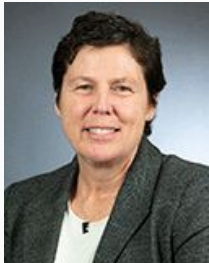
Rep. Acomb District 44B