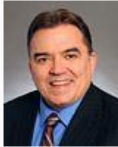
Senator Hoffman District 36