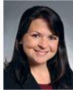
Senator Kent District 53