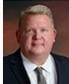
Senator Draheim District 20