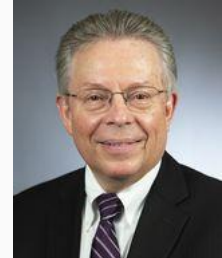
Rep. Elkins District 49B