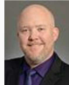
Senator Isaacson District 42