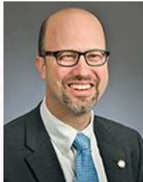
Rep. Pinto District 64B