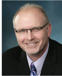
Senator Chamberlain District 38