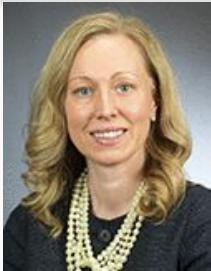
Rep. Edelson District 49A

Representatives shown are authors as of March 7, 2019.