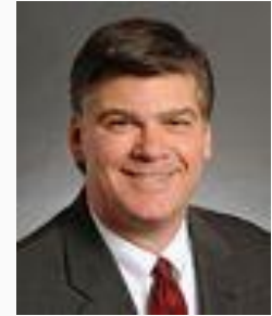
Senator Pratt District 55