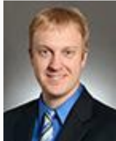
Senator Eichorn District 05