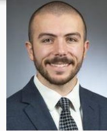
Rep. Cantrell District 56A