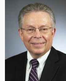
Rep. Elkins District 49B