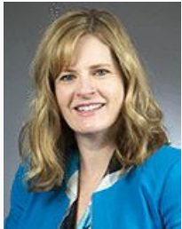
Rep. Moller District 42A