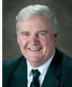
Senator Clausen District 57