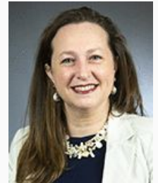
Rep. Bahner District 34B