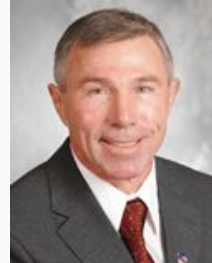
Rep. Dettmer District 39A