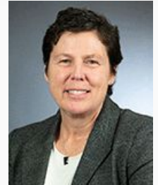
Rep. Acomb District 44B