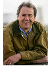
Gov. Steve Bullock Montana

...I need a Democratic Senate to help me.