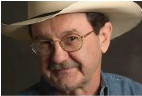
Special Guest Jim Hightower, editor of the Hightower Lowdown