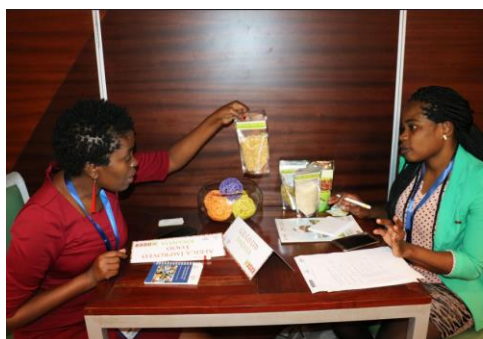
Participants at a B2B in Zambia (top) and in Rwanda (below).

Further, the B2Bs bring together actors who don't traditionally do business with one another, which creates an opportunity to address information asymmetry and policy impediments to trade. For example, Ethiopian grain sellers are well versed in exporting grain to China and Italy for industrial use, but had never explored selling surplus to Kenya, despite that country's proximity and large market. This was due in part to Ethiopia not being a member of the EAC and poor infrastructure between the countries. A "mini" B2B meeting between seven Ethiopian grain exporters and 10 Kenyan buyers in Nairobi, Kenya, in February 2017, however, served as a test case for finding solutions to payment mechanisms, logistics, trade finance and grading/quality. The B2Bs allow stakeholders to build long-term relationships and discuss ways to remove barriers to trade together.