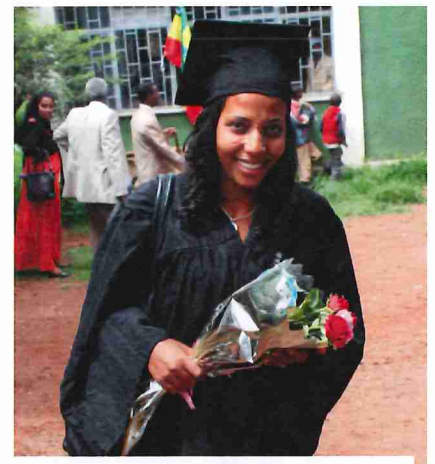
One of our graduates