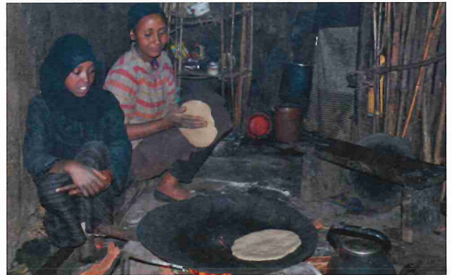
They belong in a school

In the coming months, EAVO will explore ways to expand these programs and to seek discernment for how Christ would expand our ministry to girls. We are looking forward to how God will use us, and we invite you to continue on this journey with us.