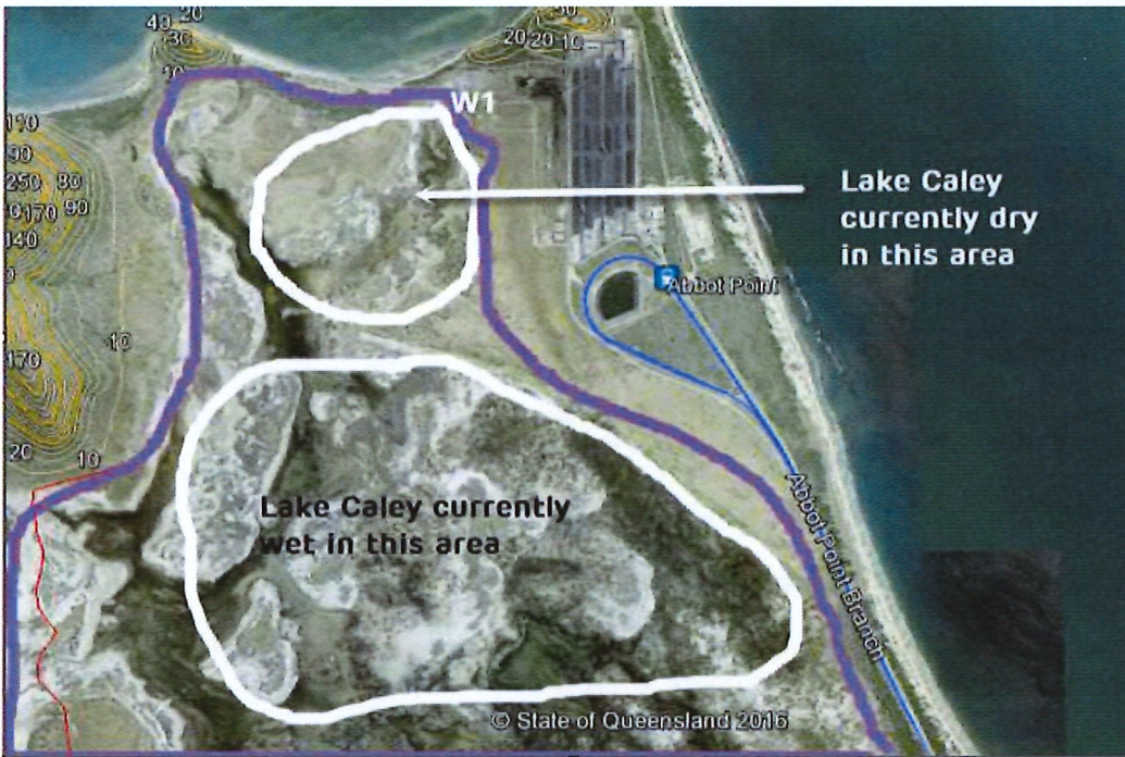
Figure 1: Contaminant Release Point – W1 for this TEL.