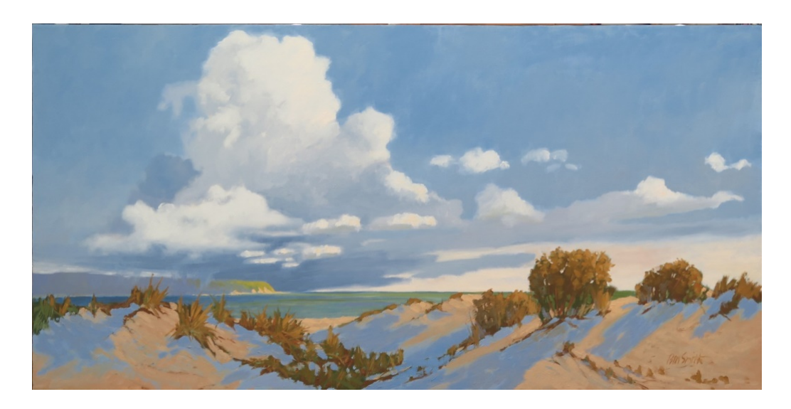
Edward Duff, #1 2.5x3.5, oil on paper, 2017

Art produced by Michigan's dunes-focused artists (examples)