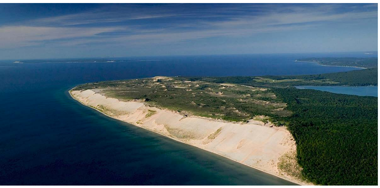
Sleeping Bear Dunes National Lakeshore, July 2004.

Michigan has more miles of freshwater coastline than any other state in the U.S., and the Great Lakes host the largest collection of freshwater sand dunes in the world. There are approximately 275,000 acres of these coastal sand dunes in Michigan -- a relatively tiny slice of the state's overall landscape -- but they provide a range of ecological, cultural and economic value to the state and its coastal communities.