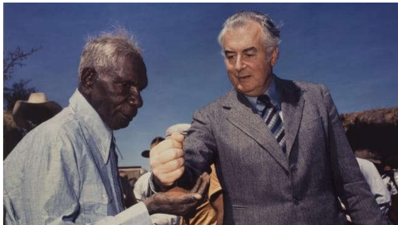
Vincent Lingiari and Gough Whitlam Prime Minister Gough Whitlam pouring sand into the palm of Gurindji leader Vincent Lingiari, August 1975.