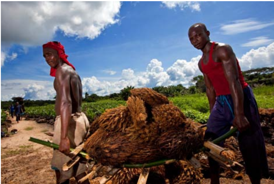
Workers at the oil palm plantation at Lokutu

Beyond their own policies and standards, Feronia and its DFI owners are also collectively committed to adhere to the World Bank Group Environmental, Health and Safety Guidelines; the Round Table for Sustainable Palm Oil Principals and Criteria for the Production of Sustainable Palm Oil; the World Bank’s IFC Performance Standards on Environmental and Social Sustainability; the Uniform Framework for Preventing and Combating Fraud and Corruption; the IFC Corporate Governance Development Framework; the OECD Guidelines for Multinational Enterprises; and the ILO Forced Labour Convention. 14