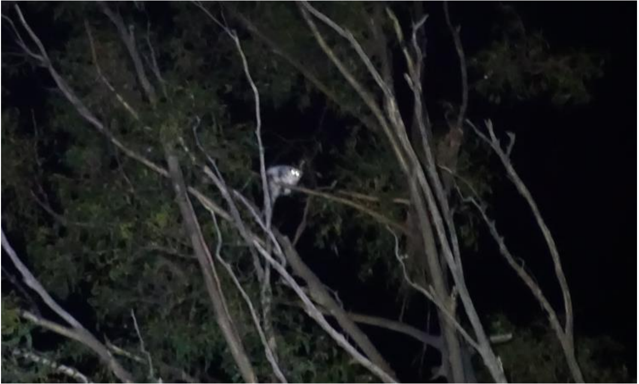
Figure 2(e). Still image of the Greater Glider (2) recorded at approximately “55 H 374874 5843829’ (UTM, Zone 55 H)”;