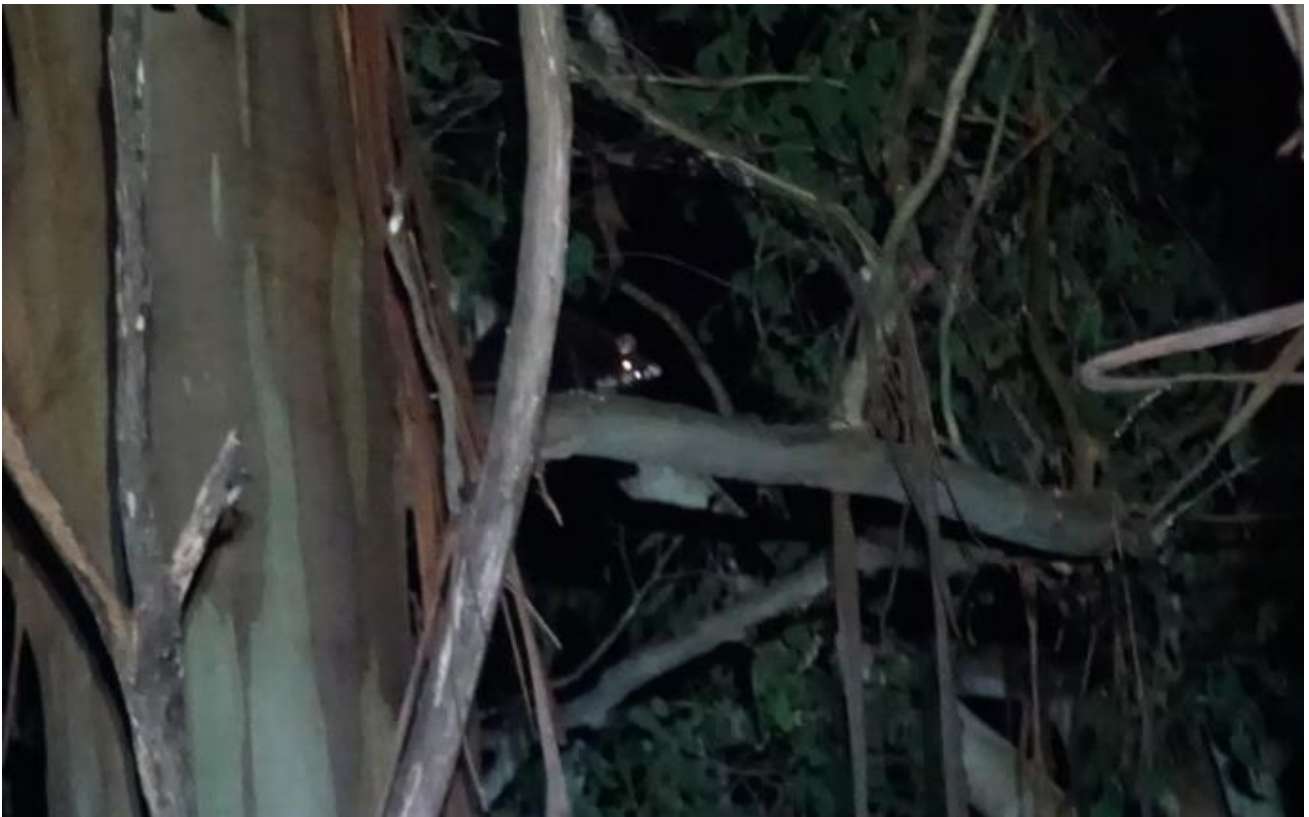
Figure 2(f). Still image of the Greater Glider (3) recorded at approximately “55 H 375329 5843842’ (UTM, Zone 55 H)”;