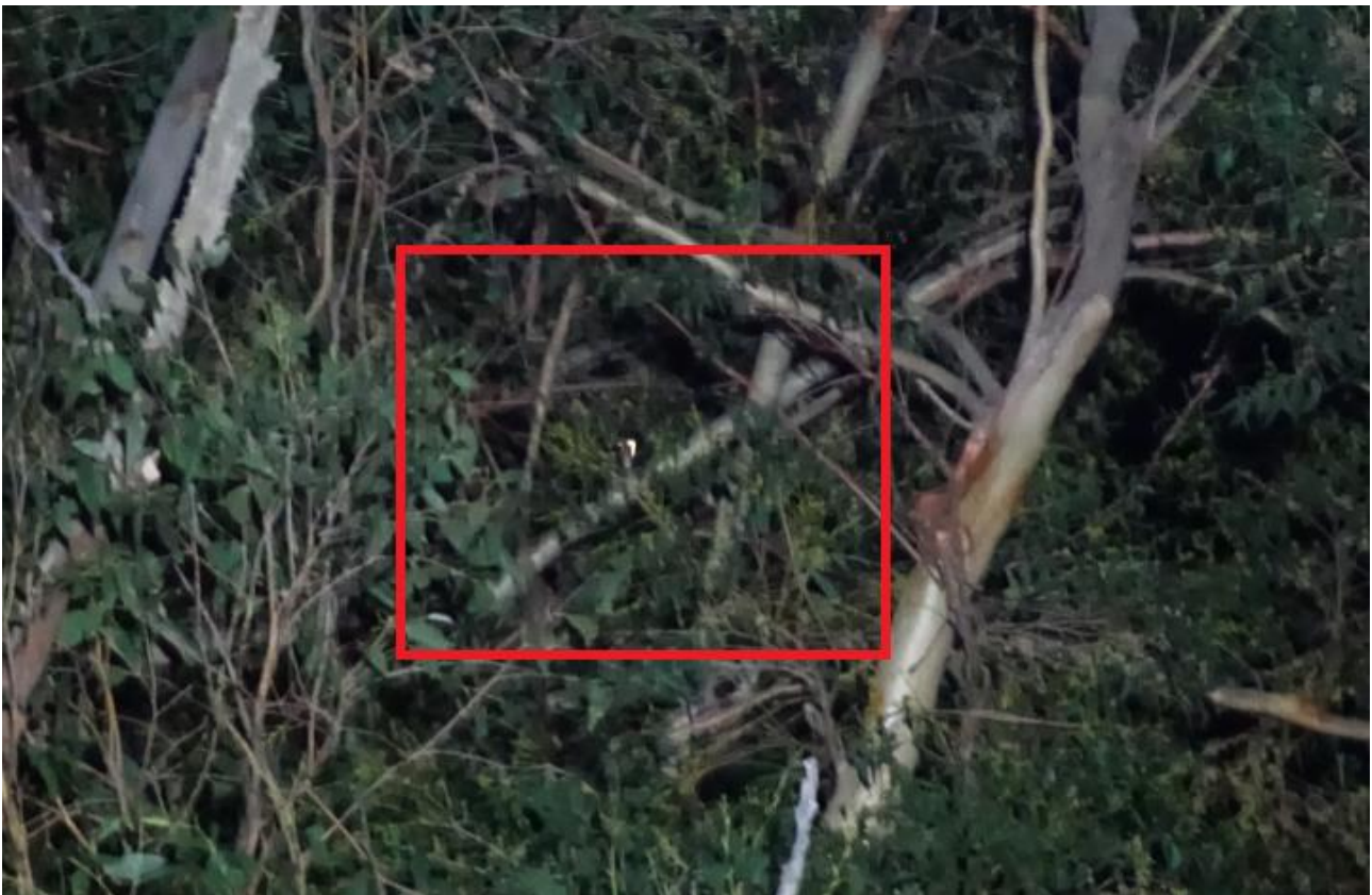
Figure 2(d). Photograph of the Greater Glider (1) recorded at approximately "55 H 374718 5843935" (UTM, Zone 55 H);