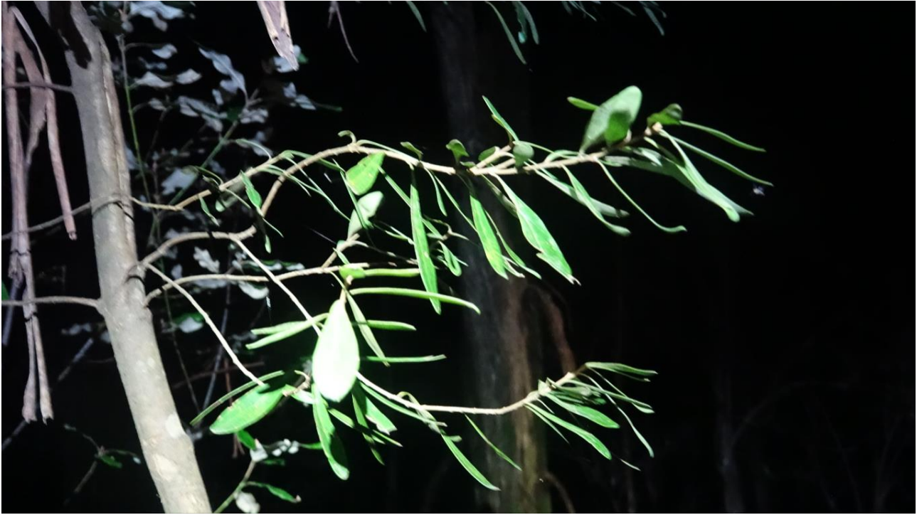
Figure 2(c). Still image of the Tree Geebung recorded at approximately "55 H 374568 5844339" (UTM, Zone 55 H);