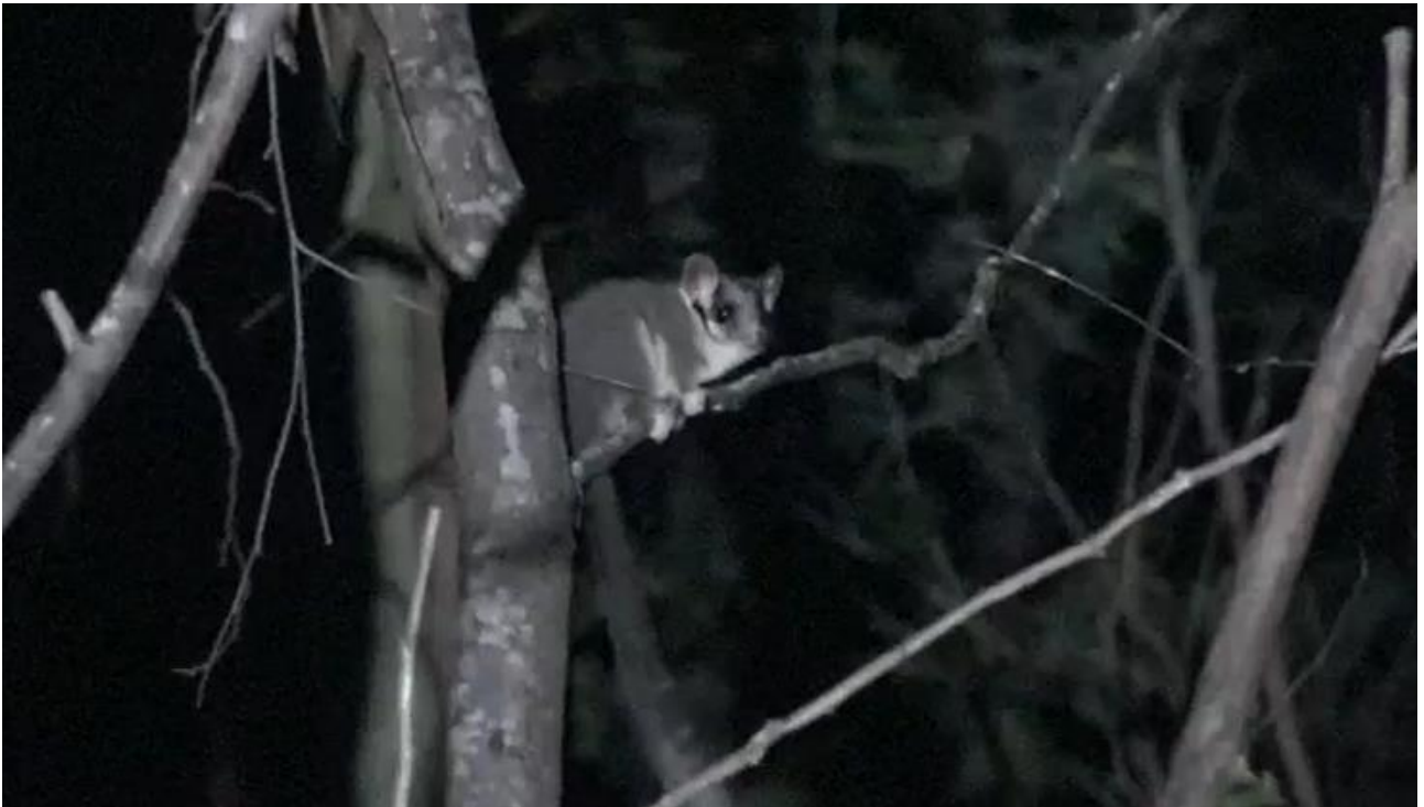
Figure 2(a). Still image of the Leadbeater's Possum recorded at approximately "55 H 374597 5844089' (UTM, Zone 55 H)";

Figure 2(a-f), Still images and photographs taken of significant Flora and Fauna recorded.