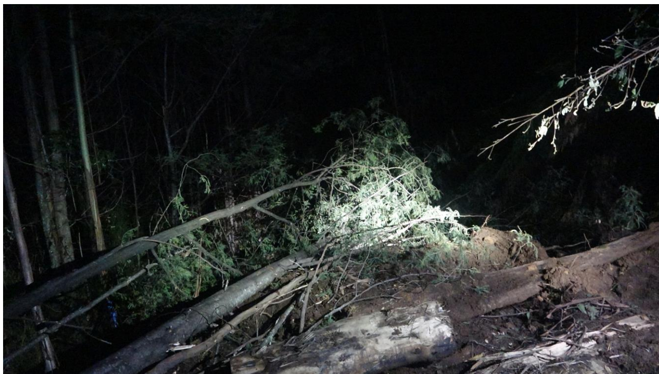
Figure 2(g). Destruction within Leadbeater's Possum habitat.