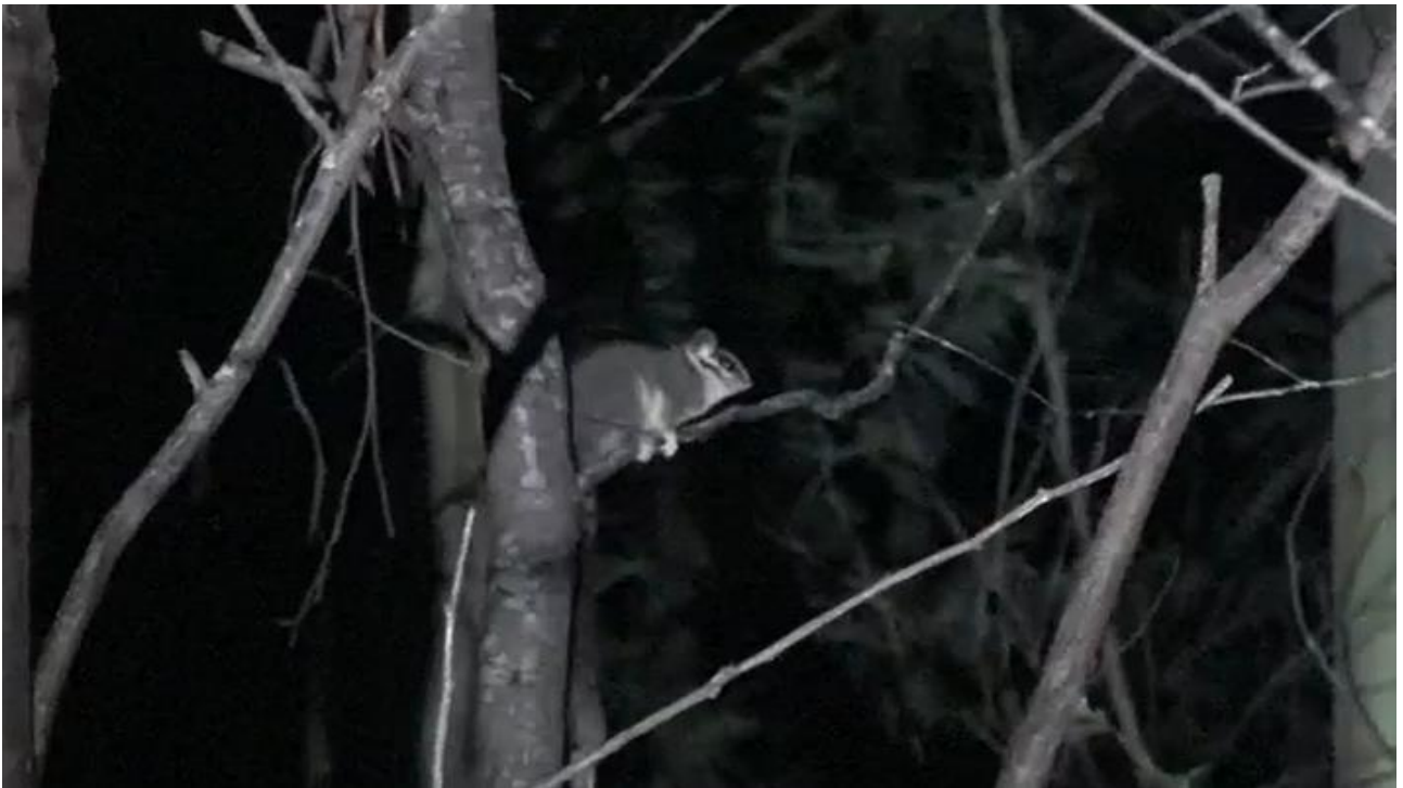
Figure 2(b). Still image #2 of the Leadbeater's Possum recorded at approximately "55 H 374597 5844089' (UTM, Zone 55 H)";