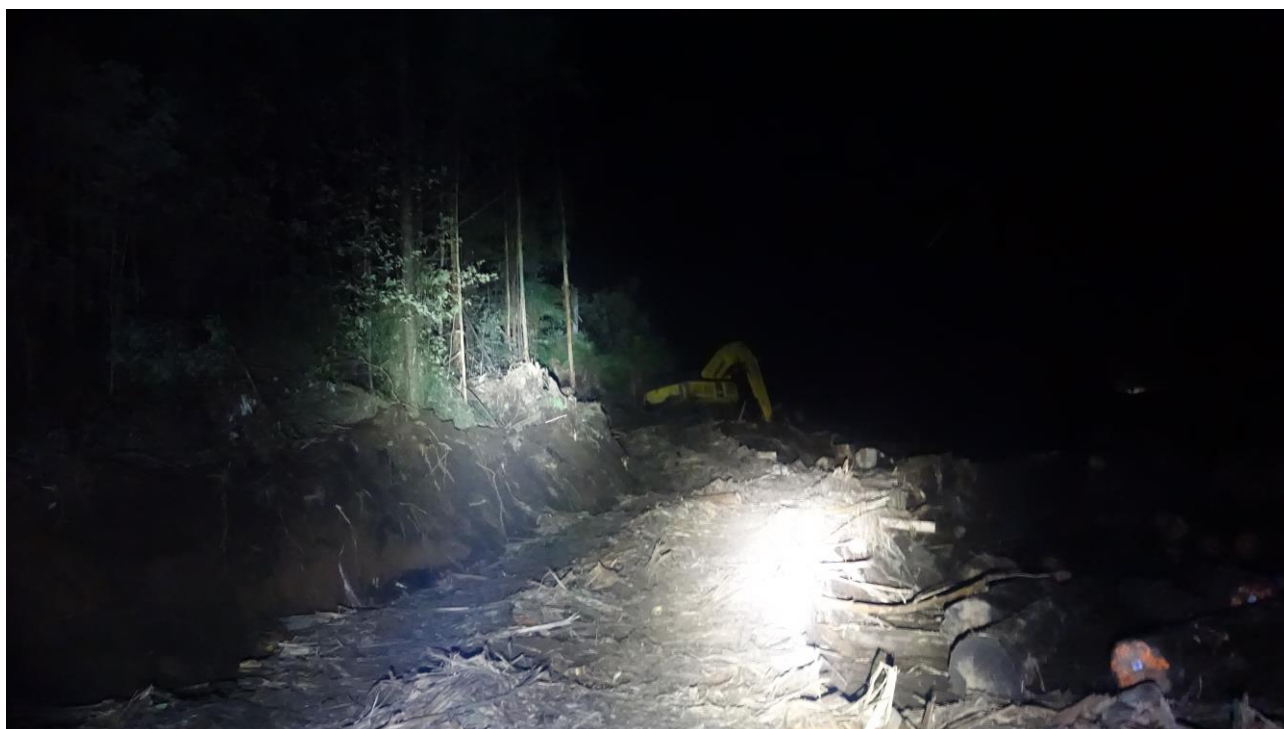
Figure 2(h). Clearfell logging operations within Leadbeater's Possum habitat.