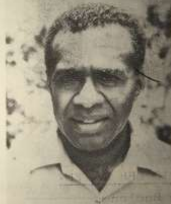
EMOSI RACULE FIJIAN