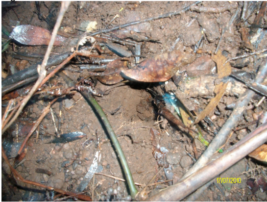
Figure 7. With stick placed inside to measure depth of hole. Figure 8. Stick that was placed inside.